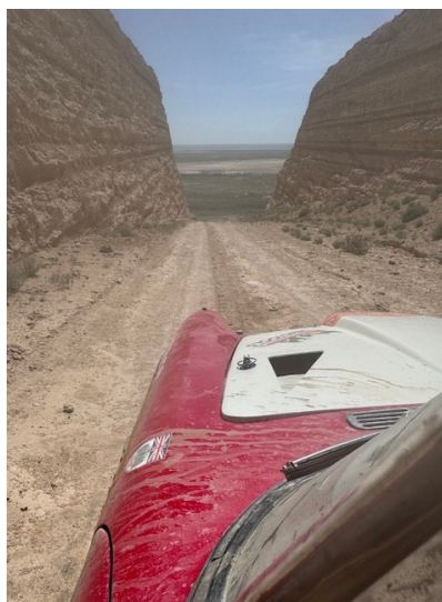
Through the canyons