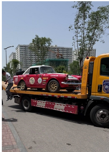
On a tow truck

By day 4 we were crossing sand dunes with humanity suddenly left behind, no more new cities, we were now camping. Apart from the odd camel there was just open, empty, vast nothingness. Meanwhile the tracks became seriously tough and corrugated rattling the car and shaking every nut and bolt until on day 9 the rattling caused metal fatigue around the rear shock absorber mountings and they shot through to the boot. The car was still driveable but to continue threatened the suspension. So, there in the middle of vast nothingness, on our own yet again, Patrick set about converting spanners into mountings to keep the shocks in place. The heat was unbearable and my job was to keep us both hydrated. I had a supply of salt replacement tablets but they dwindled fast as did our water supply. The spanner job worked enough to get us to camp. Once there he worked on the car through a sand storm late into the night. To add to the shock absorber problem, a weld on the oil sump had also been rattled to bits and we had a serious oil leak. Fortunately, the sweep teams also had welding equipment so by the morning we were up and running yet again