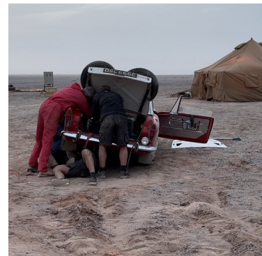
Working on the car at night in camp

It took 13 days to drive the entire width of China from East to West. From there we crossed into Kazakhstan and then across the Caspian Sea by ferry to Azerbaijan, where the cars were parked in the Formula One pits while we were entertained royally by the Azerbaijanis. Crossing the border into Georgia took some 5 hours in searing heat but was nothing on the border between Turkey and Greece where we queued for most of the day under 36 degrees of beating sun